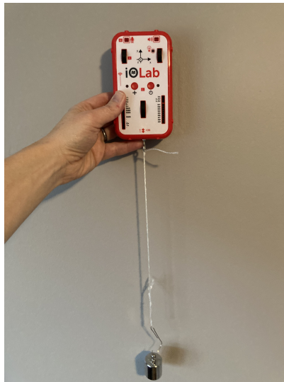
Figure 2: Adding a string to the force sensor calibration. This can be submerged in water and the weight recorded.

IMPORTANT: If you do not remember how to do the Force sensor calibration review the Prelab document section 4.2. You will be following this procedure with the following adjustment. Connect your calibration mass holder (paperclip) by a string to the eye bolt. Make the string long enough you can submerge the mass underwater. Calibrate the iOLab with the string and paperclip holder.